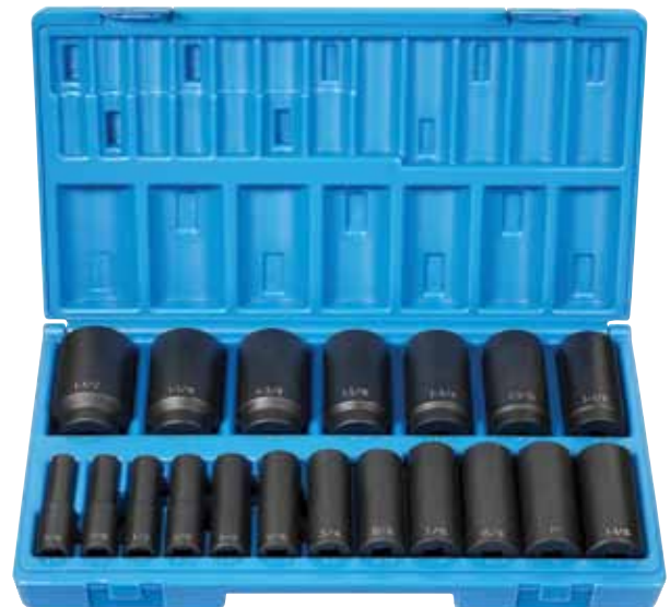
Part # 1719D

13 Piece 6 Point Impact Socket Set 1/2" Square Drive, Sizes 7/16" to 1-1/4"