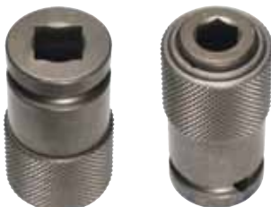
Part # QR-714 3/4" Square Drive to 7/16" Quick Change Chuck

For tools that are field ready, complete with couplers and 8' of non-conductive hose, add a "-C" to the end of the part number.