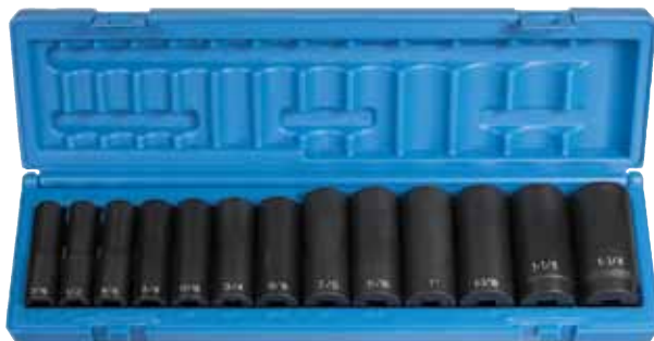
Part # 1312D

13 Piece 6 Point Impact Socket Set 1/2" Square Drive, Sizes 7/16" to 1-1/4"