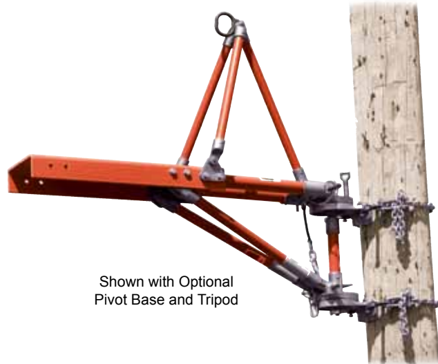
Shown with Optional Pivot Base and Tripod